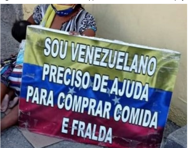
Figure 2. Photo sent via Whatsapp to one of the authors on 10 July, 2020.

Reading the Warao simply as Venezuelans initially enabled the idea that they were people who shared the same educational levels, documentation status and living conditions as the latter group. In contrast, we were faced with a group whose mother tongue was not Spanish, that had very high rates of illiteracy and little or no trajectory in the job market. It is also worth highlighting that between the end of 2019 and the beginning of 2020, the <code>interiorização</code> programmes active in the Northeast and the resources and agents mobilised in their execution had already suffered setbacks and in some cities were in a phase of discontinuity (Facundo, 2020; Vasconcelos, 2021), increasing the precarious situation of the first non-Indigenous families that had arrived in the cities.