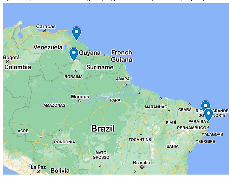
Figure 1. Map recovered from the Google maps app and modified by the authors, May 2023.

The explanation for the departure of these groups from Venezuela is often based on common sense given the intensification of the economic crisis in the country over the last ten years. This is the explanation that we found in some academic activities and that is also mobilised by colleagues and administrators at public events, as well as by many of the Warao Indigenous people we accompany. Whether you need to renew immigration documents or present yourself in the avalanche of live online debates organised during the pandemic concerning your presence in Brazil, 'the crisis' appears as a self-explanatory model of a complex reality that has been going on longer than is usually portrayed. This manner of producing an explanatory key for an immediate, superficial understanding of complex processes previously appeared in the dynamics of Haitian and Colombian migration. Due to their graphic force, 'the earthquake' and 'the conflict', respectively, became the allegory of each of those situations (Facundo, 2021, p. 208). The recurrence and indiscriminate use of these images hide a series of social processes, including that of their own production.